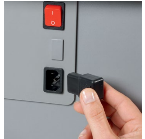
Detachable IEC power plug makes the document shredder quick and easy to move from A to B