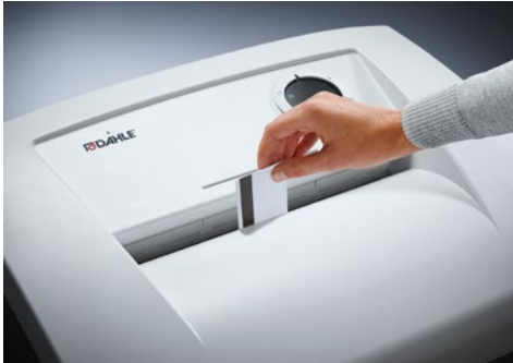
Dahle Waste 104 document shredder