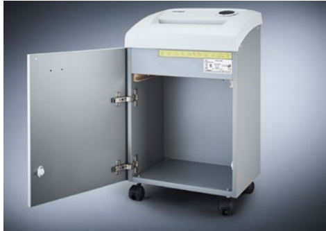
Dahle Waste 104 document shredder