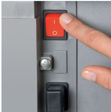
Separate main switch is located on the rear of the document shredder and completely disconnects it from the mains power supply