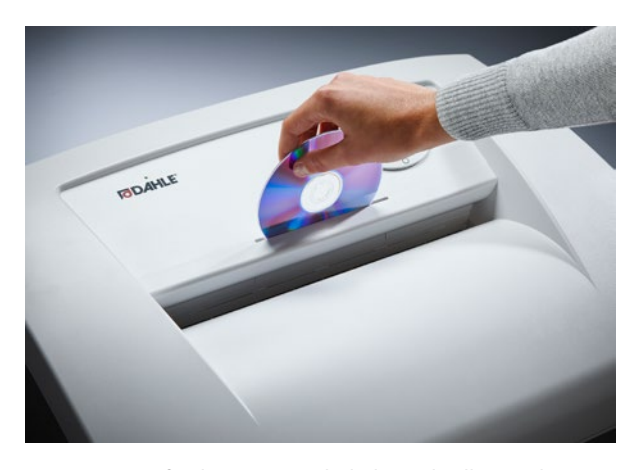
Separate CD feed opening with dedicated collection bin for environmentally friendly waste separation and secure destruction