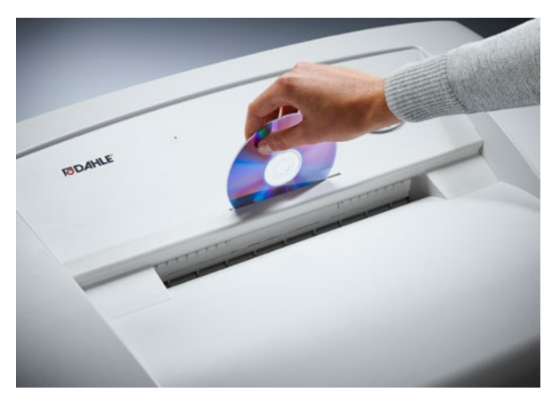
Separate CD feed opening with dedicated collection bin for environmentally friendly waste separation and secure destruction