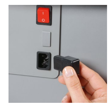
Detachable IEC power plug makes the document shredder quick and easy to move from A to B

Separate main switch is located on the rear of the document shredder and completely disconnects it from the mains power supply