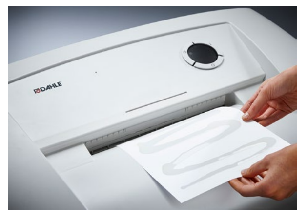
Dahle Waste 114 document shredder