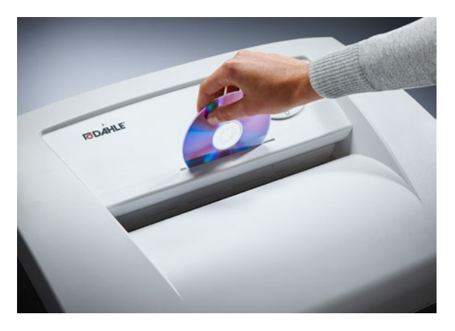
Separate CD feed opening with dedicated collection bin for environmentally friendly waste separation and secure destruction