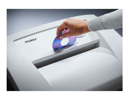
Dahle Waste 104 document shredder